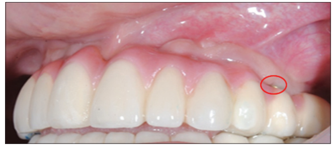
Figure 4: Gum recession around tooth number 25, revealing metal exposure and gap formation

The mean number of grafted tooth sites in the CTG group was 5 \pm 2.0 . Based on the number of grafts received, the majority of the patients (56.60%) had six, seven or eight tooth sites grafted. A significant proportion of the 53 patients (87%) needed soft-tissue augmentation at the canine teeth (no. 13 and 23), P < 0.001 . The lowest proportions of CTGs were