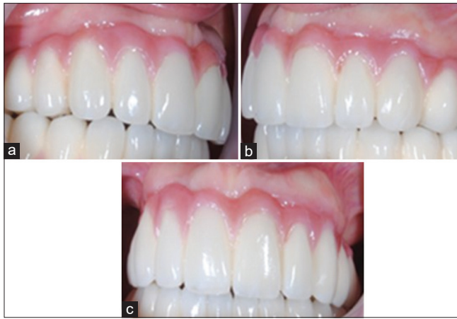
Figure 3: (a-c) 1-year and 6-month post-operative appearance, showing a good adaptation of healthy augmented mucosa to the margins of the prosthesis